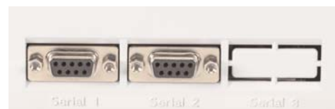
Two Standard RS-232C Ports