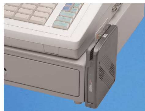
DataTran™ Integrated Credit Option