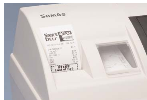
Quick and Easy Drop and Print Paper Loading